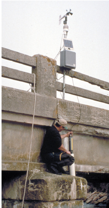
YSI 6200 used with a YSI sonde at a bridge deployment for remote river monitoring.

If a program's principal objective is to forewarn a water treatment facility of an impending cyanobacteria bloom and its consequent taste and odor problems, the parameters selected – i.e., DO, temperature, chlorophyll and turbidity – will reflect that priority. So too will measurement frequency which will be (at least) near continuous, and may also have spatial, temporal and seasonal components. The data acquisition system in this case must not only measure key parameters associated with pre-bloom and bloom conditions, but must also have the capability to "analyze" data based on end-user-prescribed criteria. If water quality conditions appear to meet pre-defined criteria, the system must then provide response, not the least of which is to communicate the apparent approach of a problematic water quality event. Response might also include the actuation of the opening or closing of a weir or gate and the actuation of a pretreatment or interim treatment system (i.e., an aerator).